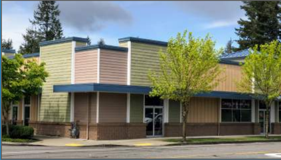
COOPER POINT VILLAGE